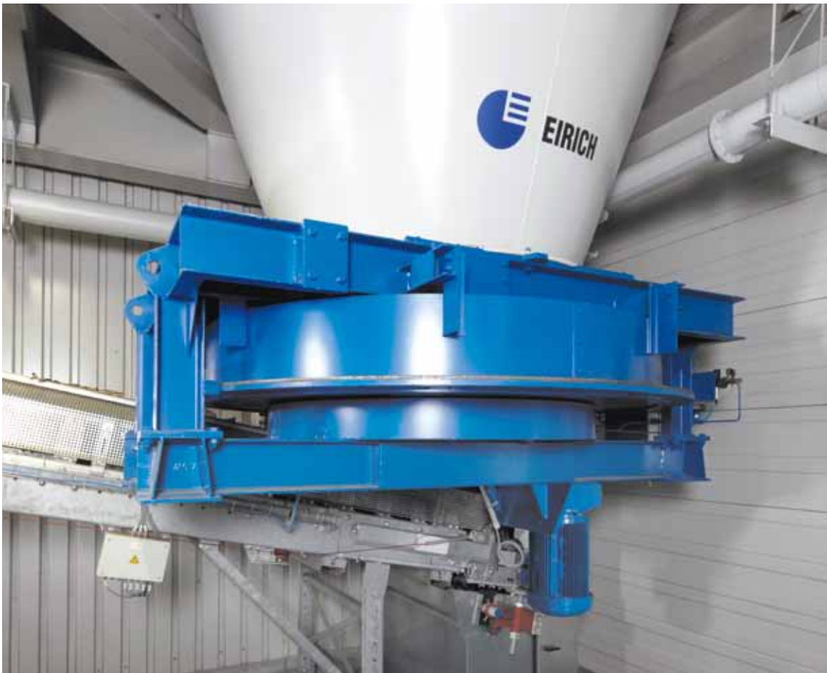
Picture 2 UE24 table feeder Silo discharge unit version